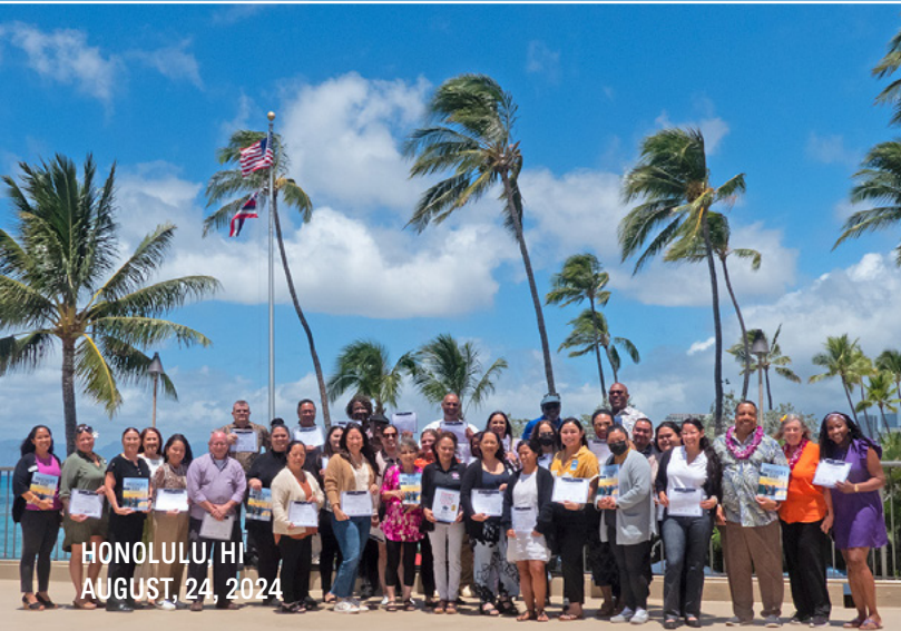
HONOLULU, HI AUGUST 24, 2024