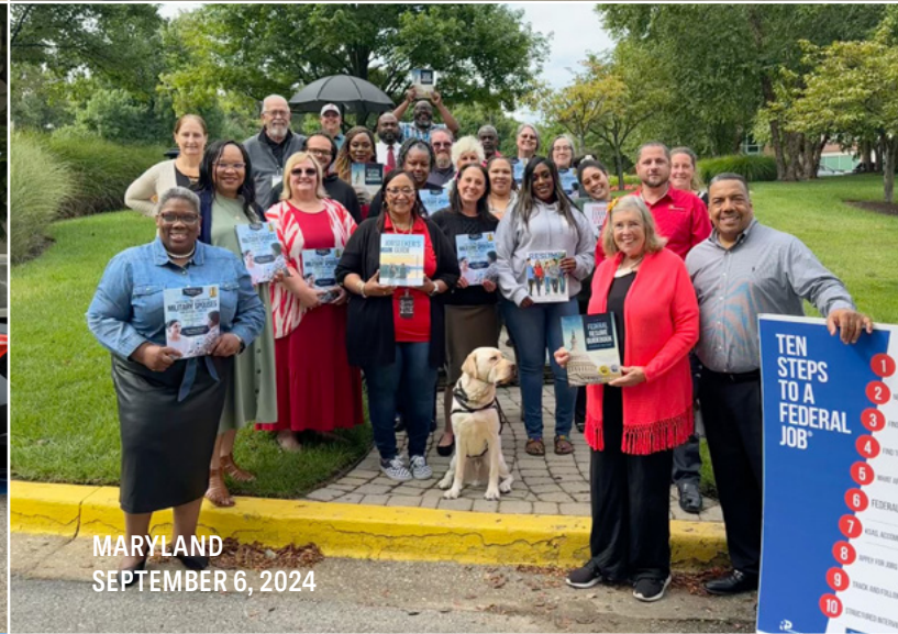
MARYLAND SEPTEMBER 6, 2024