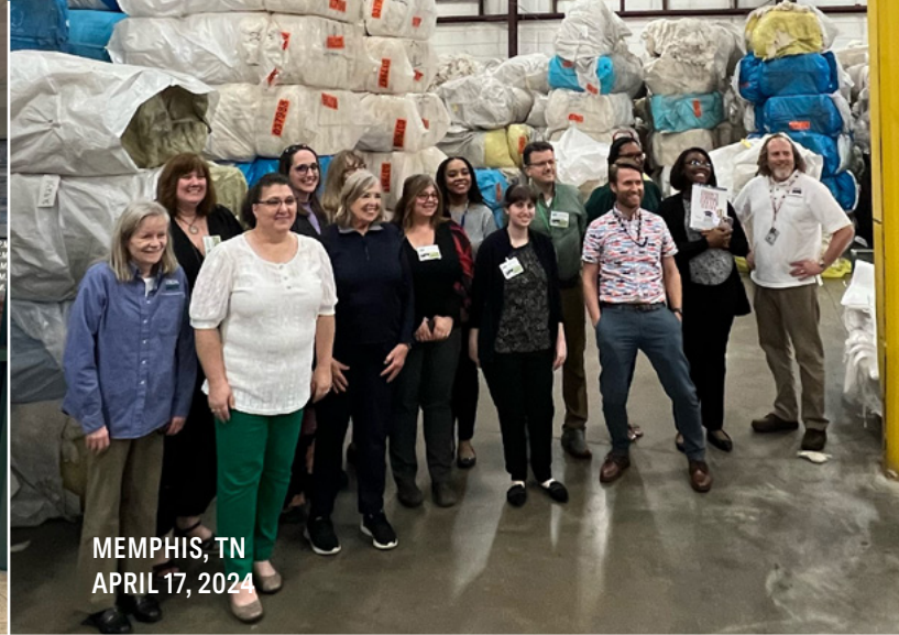
MEMPHIS, TN APRIL 17, 2024