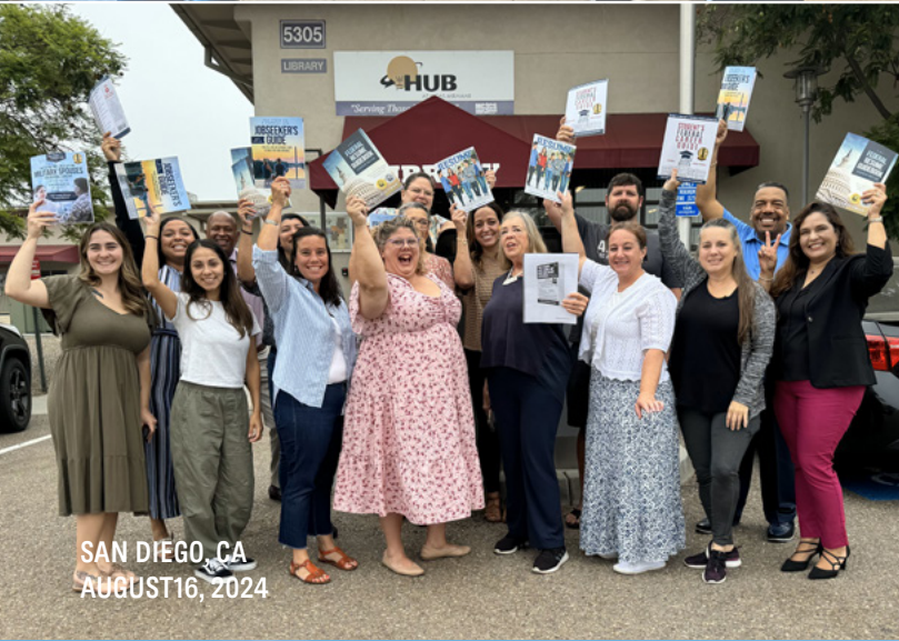
SAN DIEGO, CA AUGUST 16, 2024